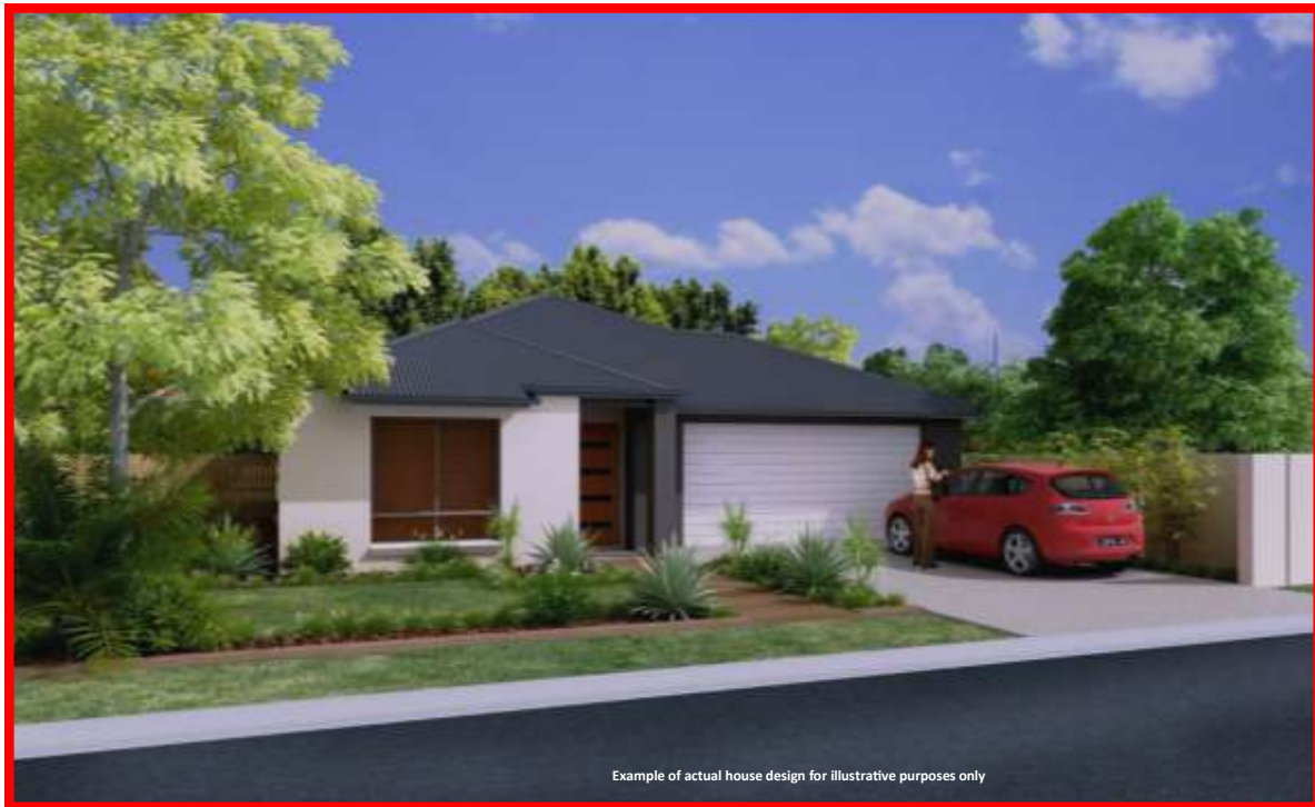
Example of actual house design for illustrative purposes only

Ph: (07) 3355 0401 Freecall: 1800 155 611 Fax: (07) 3112 4363 Mob: 0414 682 701 Email: admin@qpsig.com.au